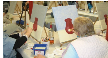
Monthly Painting Classes - "Palette Pleasures"

The Isabel Anderson Comer Museum & Arts Center houses hundreds of memorabilia from our native son Jim Nabors. Nabors' was born and raised in Sylacauga. His singing career began at Sylacauga High School, where he was featured in numerous performances of the High School's Glee Club. He is also known to television viewers as Gomer Pyle, the bumbling gas station attendant on The Andy Griffith Show (above). From that role, a new series was born, and Jim Nabors became known as "Gomer Pyle, USMC". A very successful Jim Nabors Hour, which displayed his true singing capabilities.