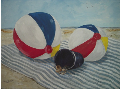
Painting for ArtPartners Auction

At least twelve art exhibitions show annually. The recognized annual exhibits are the Congressional Student Art Competition, Sylacauga City Schools, Photography Competition, Artist Selects, ArtPartners (Special Needs Art Exhibit and Auction) and Local Artists Expo.