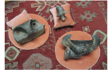
Decorative animal effigy pieces and clay pipe fragment

Prior to its incorporation as a town in 1834, Sylacauga was home to Shawnee Indians, who came to this area from Ohio and became part of the Creek Confederacy. Archeological digs have uncovered artifacts of Indian, Spanish and other European origins. Many are on display in the museum.