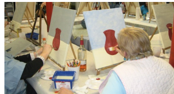
Monthly Painting Classes - "Palette Pleasures"

The Isabel Anderson Comer Museum & Arts Center houses hundreds of memorabilia from our native son Jim Nabors. Nabors' was born and raised in Sylacauga. His singing career began at Sylacauga High School, where he was featured in numerous performances of the High School's Glee Club. He is also known to television viewers as Gomer Pyle, the bumbling gas station attendant on The Andy Griffith Show (above). From that role, a new series was born, and Jim Nabors became known as "Gomer Pyle, USMC". A very successful Jim Nabors Hour, which displayed his true singing capabilities.